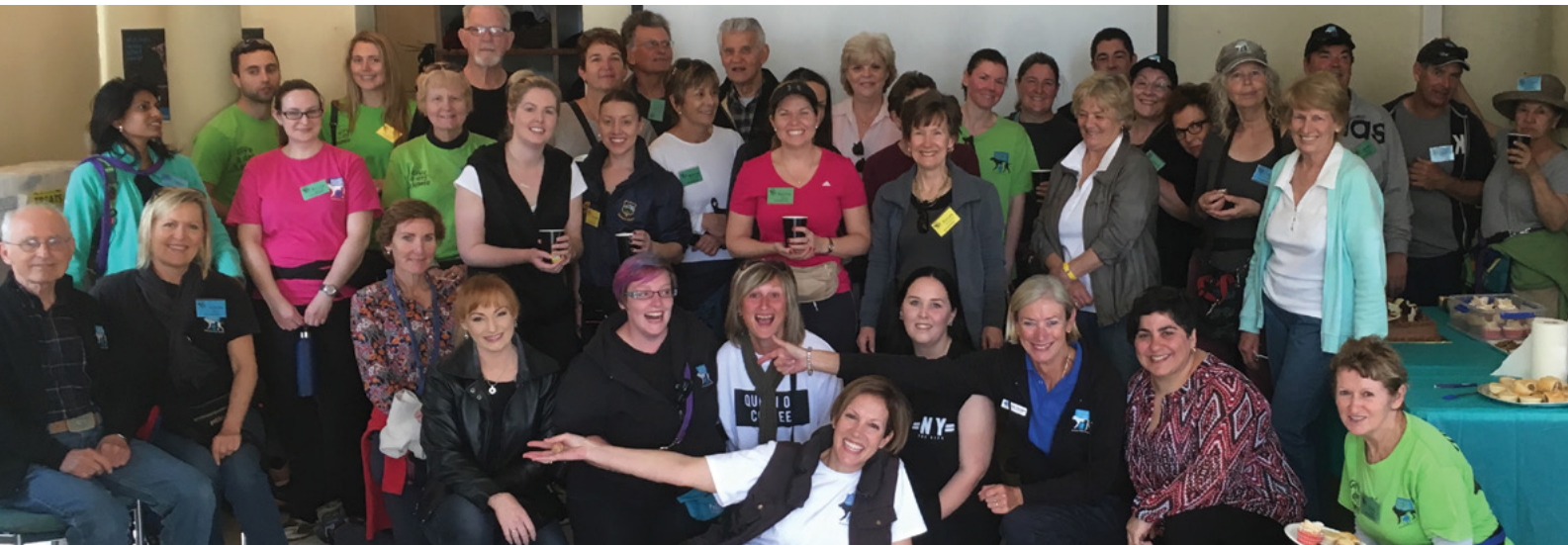
STAFF (As at June 2016)

“We’re for dogs”, but we simply couldn’t achieve the successes we do without a huge team of engaged, committed, ethical and skilled people. We can’t thank our staff or volunteers enough, who are required each and every day to go the ‘extra mile’ and make a difference to dogs desperately in need of a second chance.