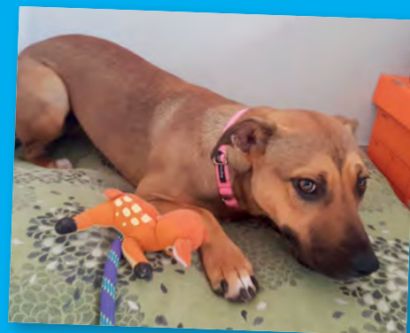
Poor Priya on arrival