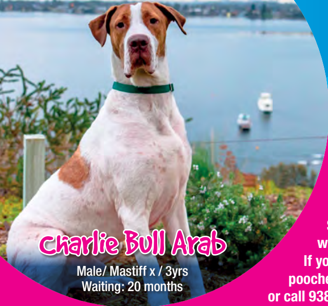
Charlie Bull Arab

Male / Mastiff x / 3yrs Waiting: 20 months