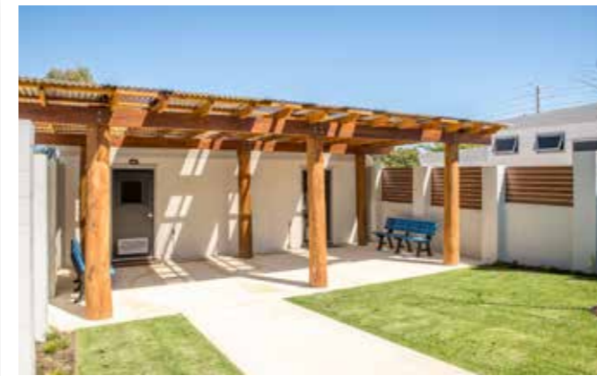
Decompression Kennels – Designed to reduce stress and provide calm, quiet spaces for dogs in need.