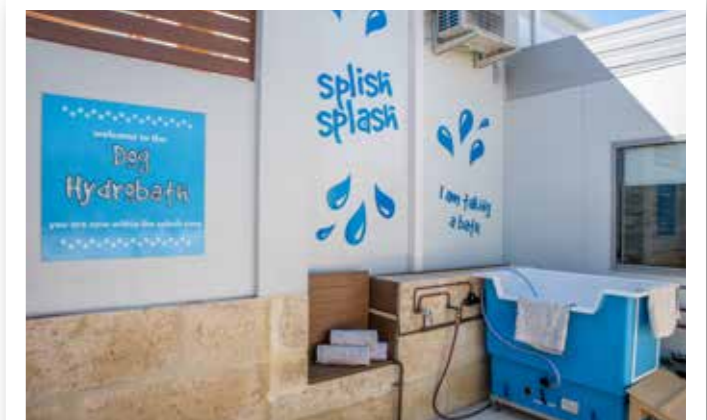
Hydrobath – A calm and quiet purpose-built space for our dogs to receive a soothing bath and freshen up!