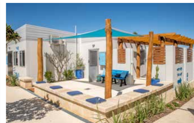
Services Building with Cat Meet Lounge – A new kitchen, laundry, storage and a unique meeting area for dogs to be gently introduced to potential feline siblings.