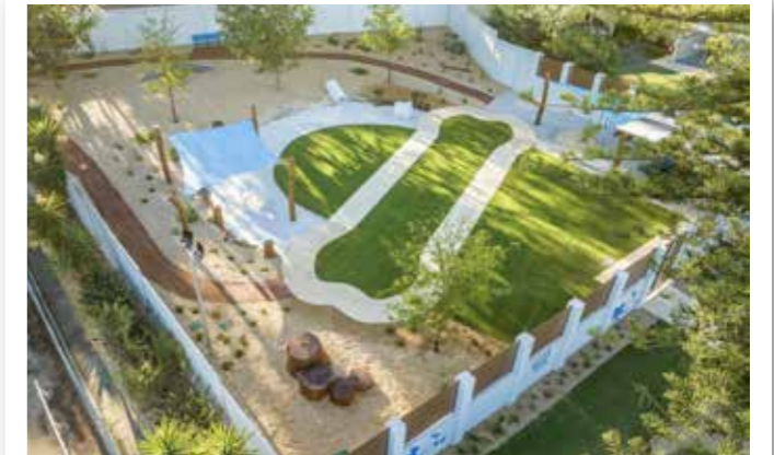
Agility & Enrichment Yard – A dedicated space for exercise, training, and play, as well as an indoor 'sniffspace' for our dogs to explore and use their noses!