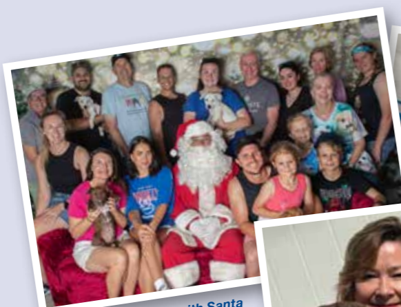
The Doghouse Team with Santa