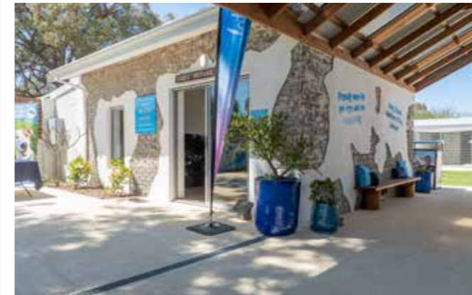
Heritage Centre – Showcasing the Refuge's rich 90-year history and its enduring place in the WA community.