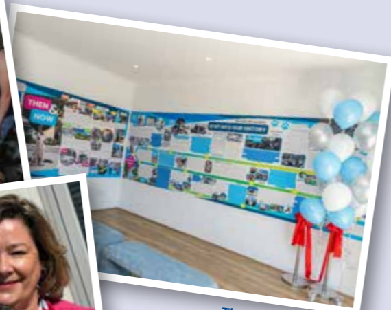
The Heritage Centre