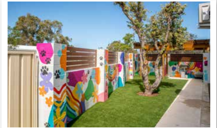
Puppy & Clinic Centre – Providing specialised care for the youngest and most vulnerable dogs. The Puppy Centre couldn't have come at a more crucial time, as we are being inundated with young puppies and mothers with litters.